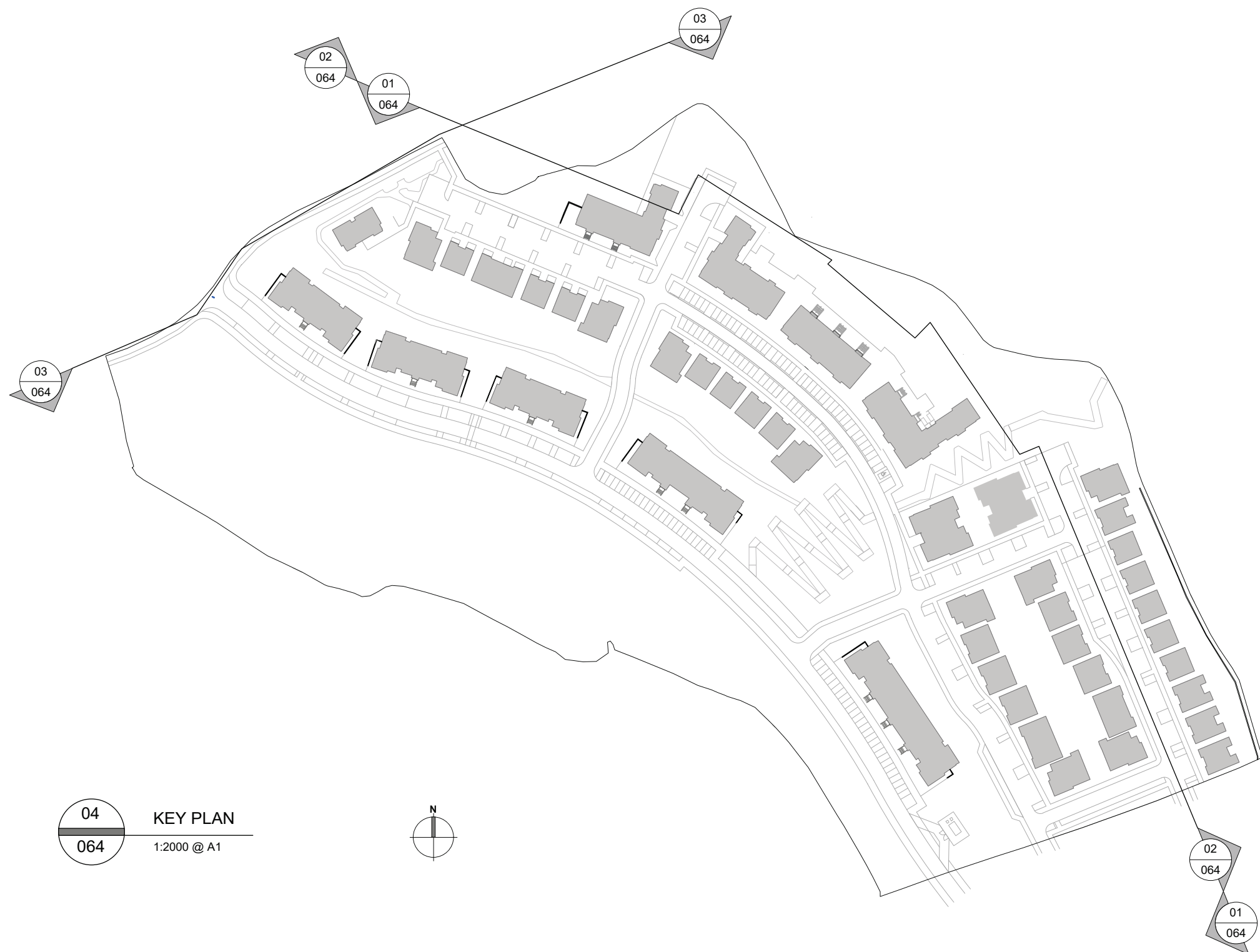
04 KEY PLAN 064 1:2000 @ A1