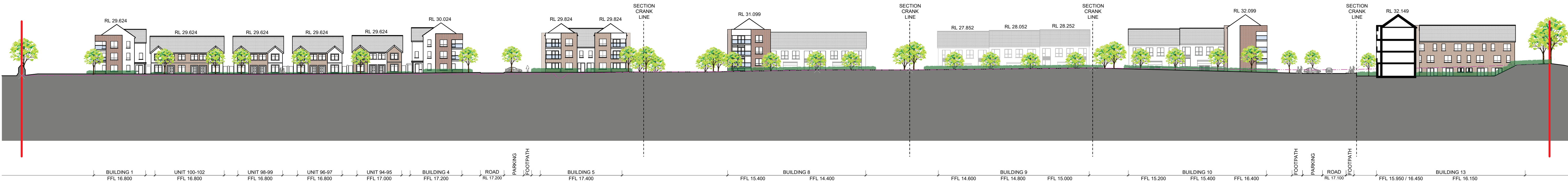
01 SITE SECTION 13-13 (SOUTH) 064 1:500 @ A1

NOTES RELEVANT TO PARTICULAR JOB STAGE: SKETCH AND DESIGN STAGE ALL DRAWINGS ARE FOR DISCUSSION PURPOSES ONLY. DRAWINGS ARE NOT TO BE USED FOR ANY OTHER PURPOSE. PLANNING STAGE ALL DRAWINGS ARE FOR PLANNING APPLICATION PURPOSES ONLY. DRAWINGS ARE NOT TO BE USED FOR ANY OTHER PURPOSE. ANY CHANGES MADE TO THESE DRAWINGS ARE SUBJECT TO IMMEDIATE APPROVAL BY BRIAN DUNLOP ARCHITECTS. ANY CHANGES TO THESE DRAWINGS MAY HAVE PLANNING IMPLICATIONS. FIGURED DIMENSIONS ONLY TO BE USED FROM THIS DRAWING. CONSTRUCTION STAGE ALL DRAWINGS ARE FOR CONSTRUCTION PURPOSES ONLY. DRAWINGS ARE NOT TO BE USED FOR ANY OTHER PURPOSE. DRAWINGS TO BE CHECKED ON SITE BY THE CONTRACTOR PRIOR TO COMMENCEMENT OF ANY WORK. BRIAN DUNLOP ARCHITECTS TO BE INFORMED OF ANY DISCREPANCIES IMMEDIATELY. FIGURED DIMENSIONS ONLY TO BE USED FROM THIS DRAWING.