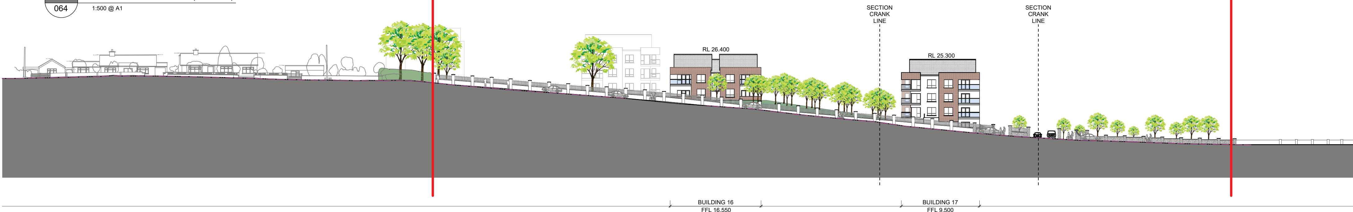
03 SITE SECTION 14-14 (PUBLIC ROAD ELEVATION) 064 1:500 @ A1