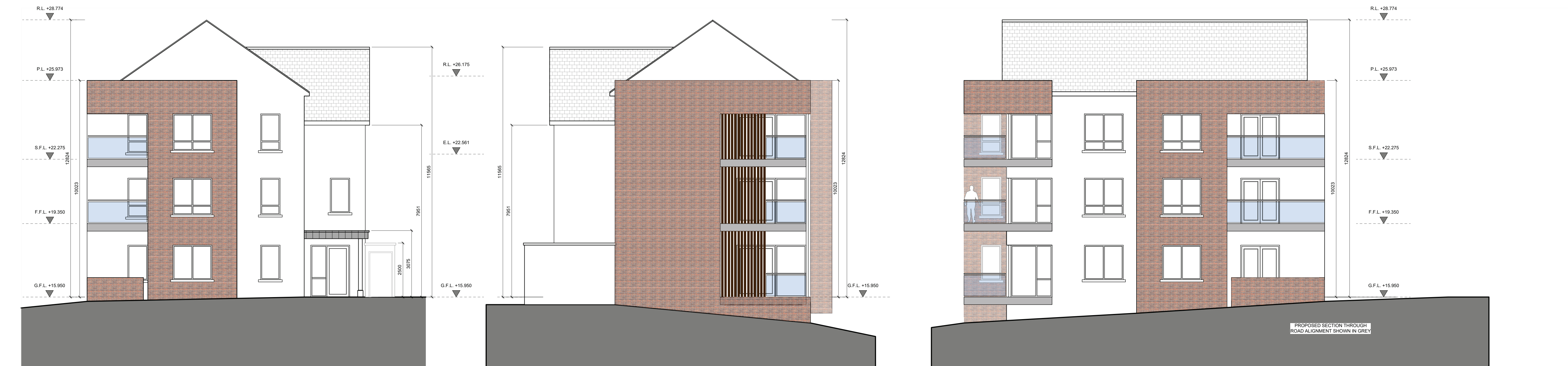
01 PROPOSED FRONT ELEVATION 200 1:100 @ A1