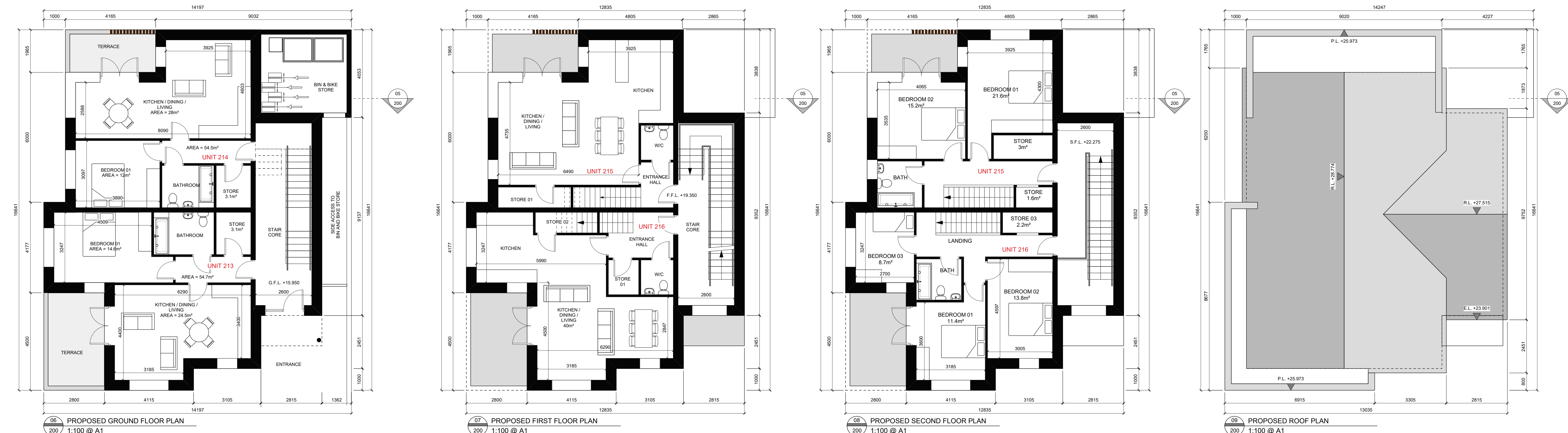
06 PROPOSED GROUND FLOOR PLAN 200 1:100 @ A1