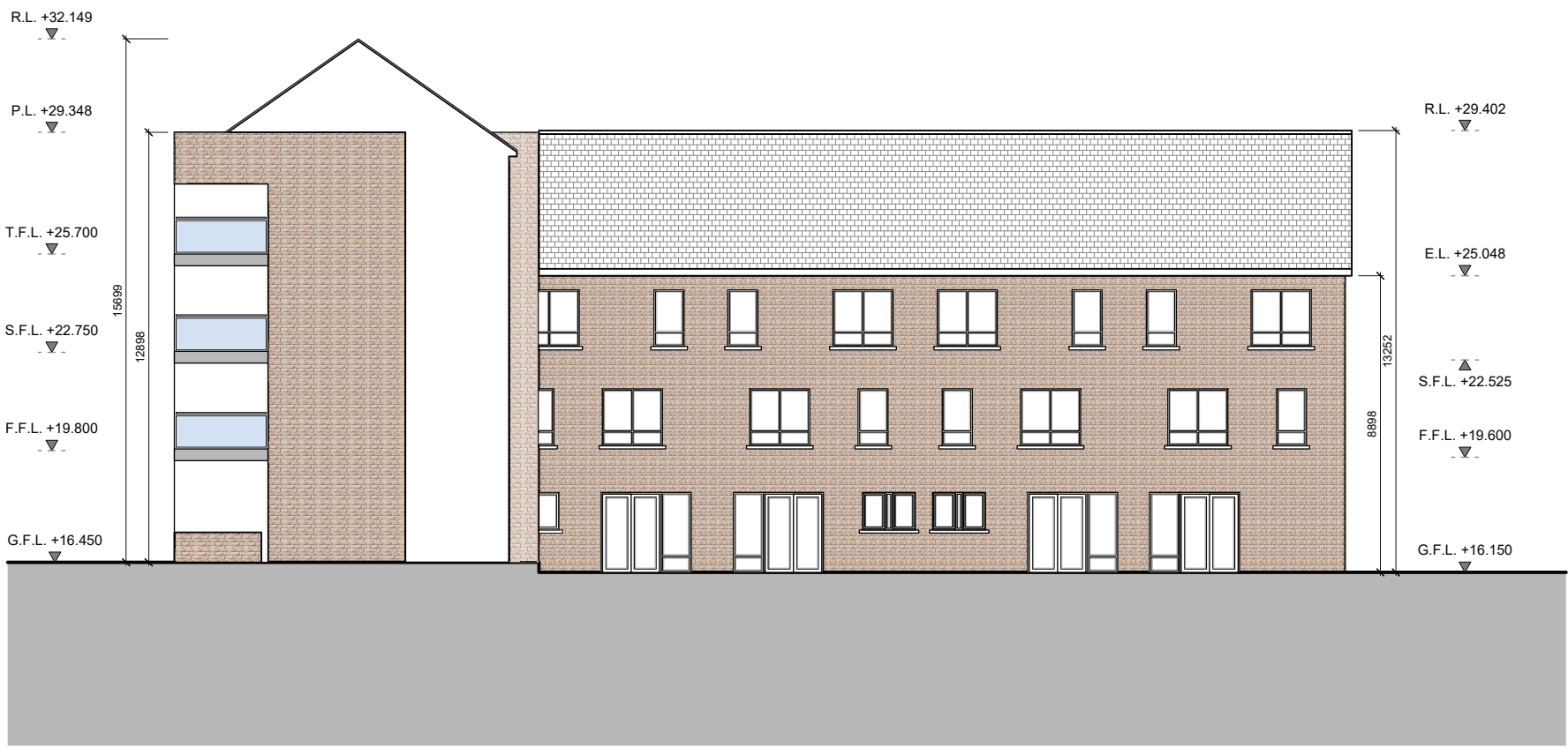
02 REAR ELEVATION 196 1:200 @ A1