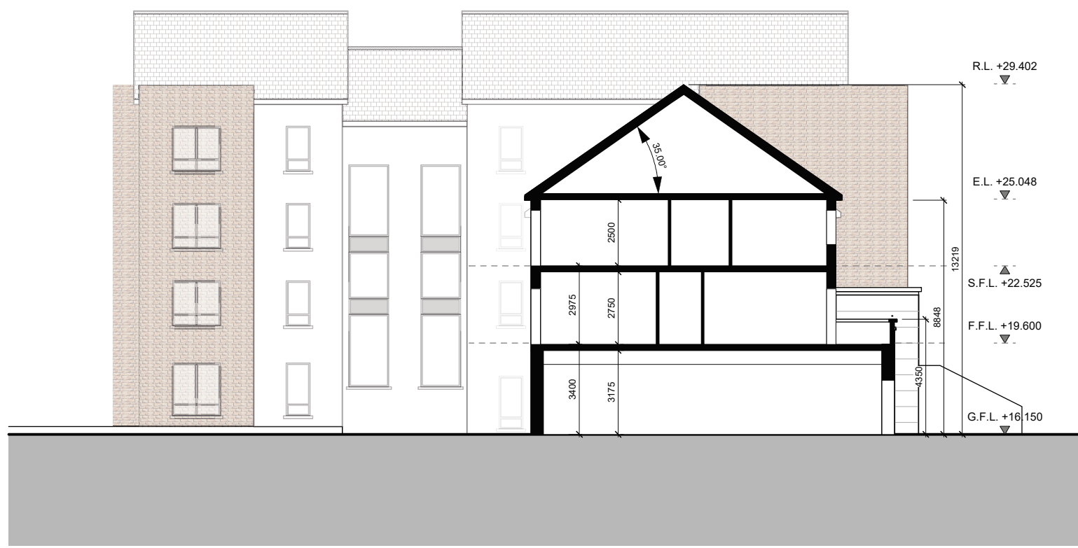
05 SECTION A-A 196 1:200 @ A1

NOTES RELEVANT TO PARTICULAR JOB STAGE: SKETCH AND DESIGN STAGE ALL DRAWINGS ARE FOR DISCUSSION PURPOSES ONLY. DRAWINGS ARE NOT TO BE USED FOR ANY OTHER PURPOSE.