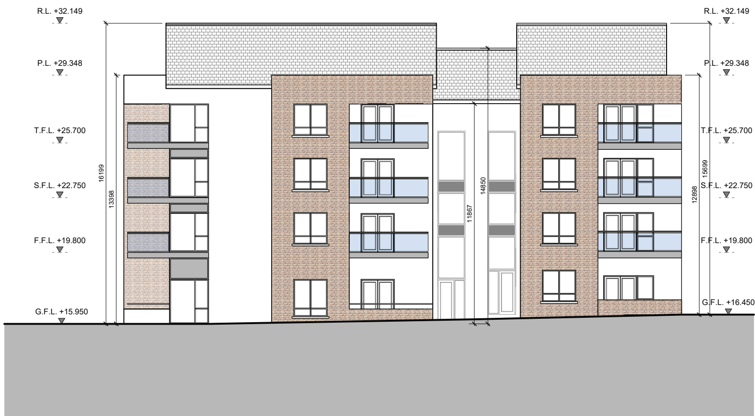
03 SIDE ELEVATION 196 1:200 @ A1