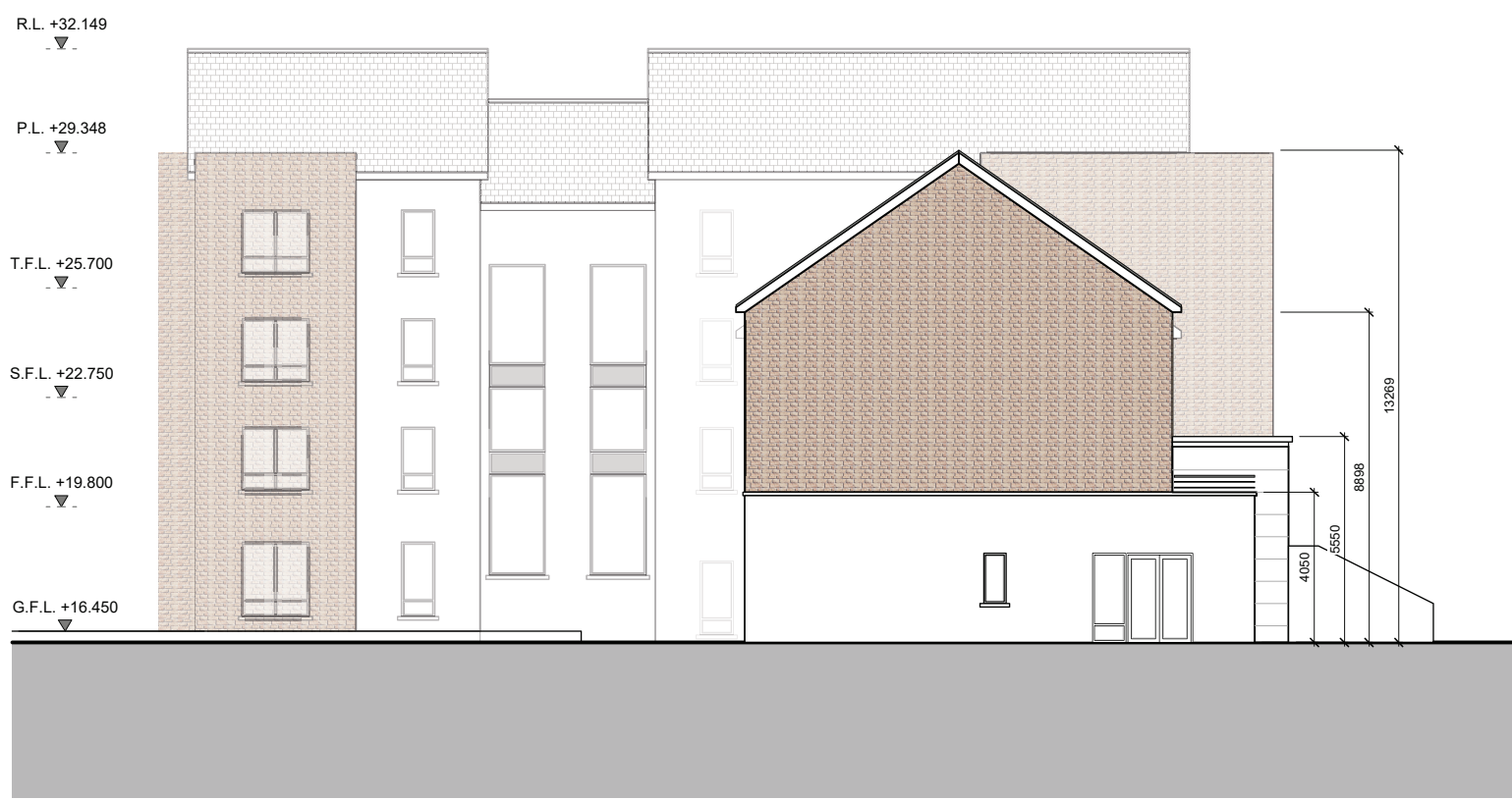
04 SIDE ELEVATION 196 1:200 @ A1