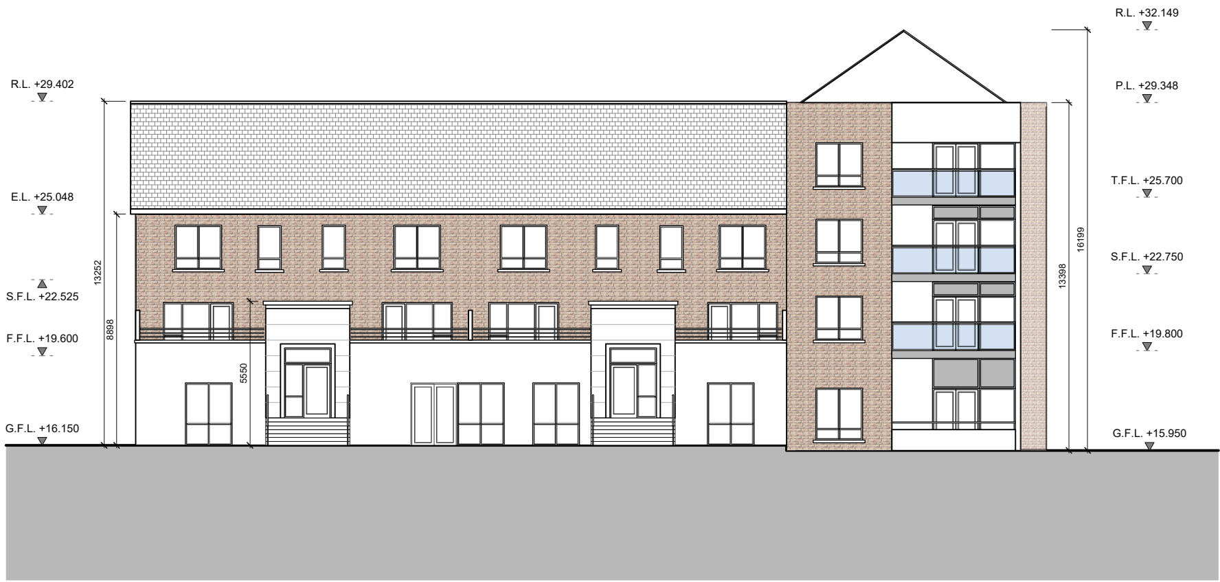
01 FRONT ELEVATION 196 1:200 @ A1