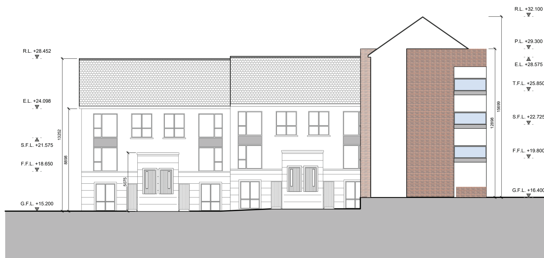
02 REAR ELEVATION 181 1:200 @ A1