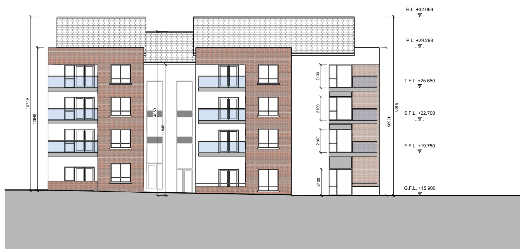
03 SIDE ELEVATION 181 1:200 @ A1