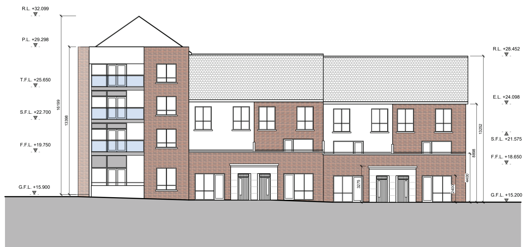
01 FRONT ELEVATION 181 1:200 @ A1