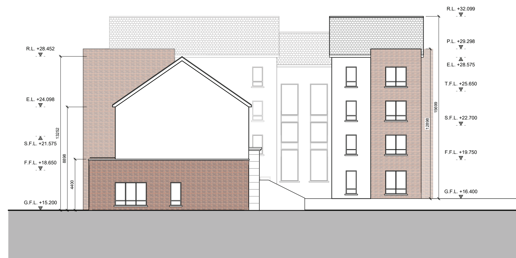
04 SIDE ELEVATION 181 1:200 @ A1