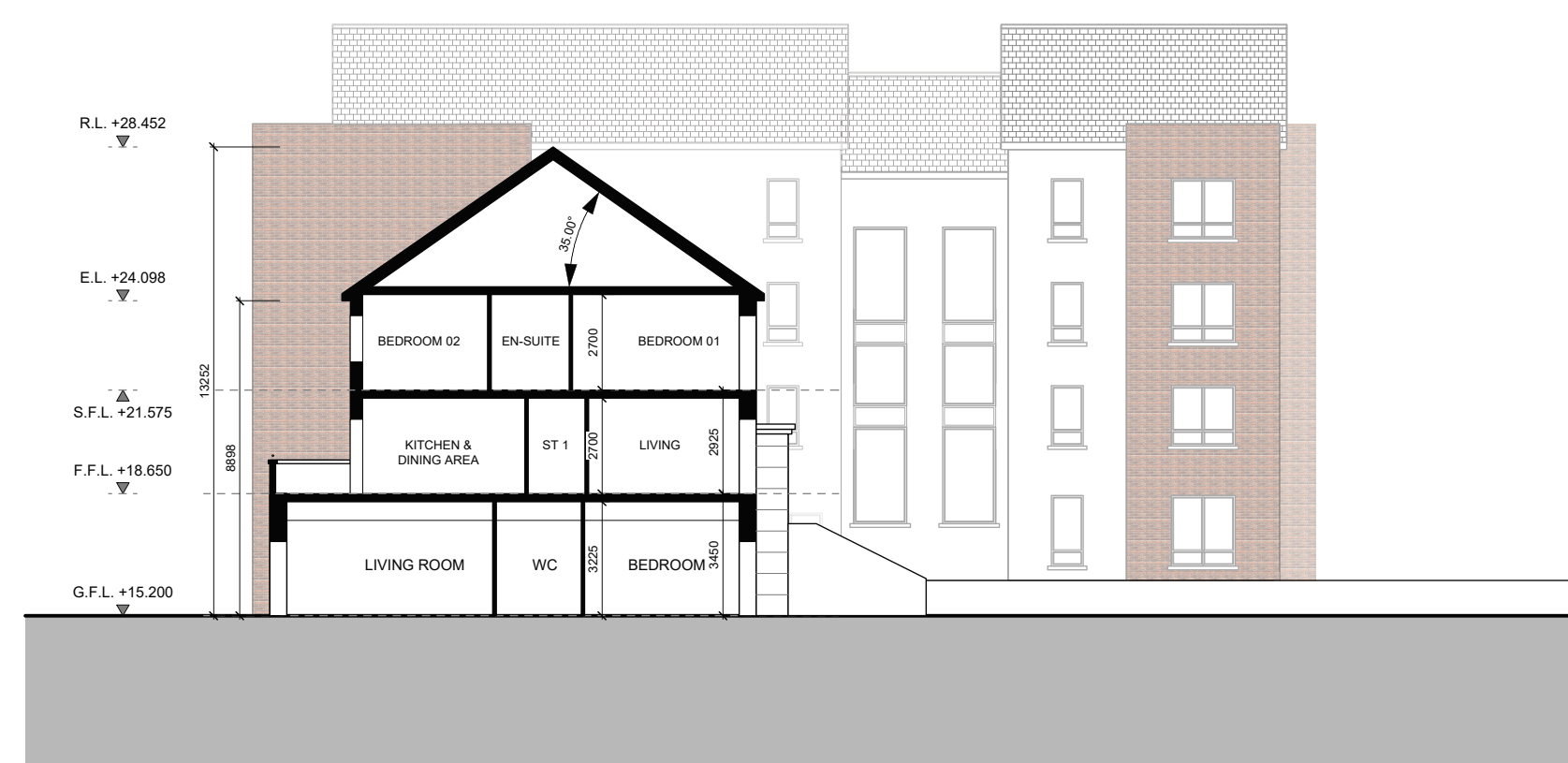
05 SECTION A-A 181 1:200 @ A1

NOTES RELEVANT TO PARTICULAR JOB STAGE: SKETCH AND DESIGN STAGE ALL DRAWINGS ARE FOR DISCUSSION PURPOSES ONLY. DRAWINGS ARE NOT TO BE USED FOR ANY OTHER PURPOSE.